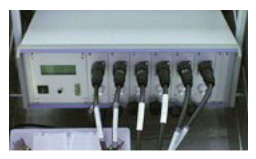
LLF-M with 6 signal channels